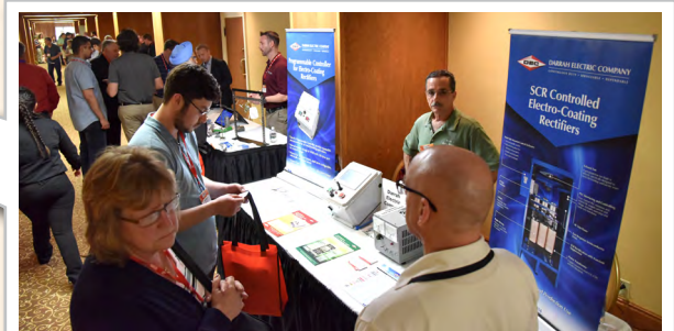
TABLETOPS (IN HALLWAYS)