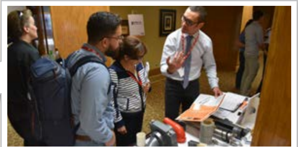
TABLETOPS (IN HALLWAYS)